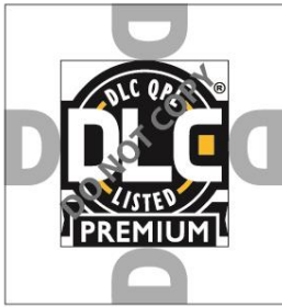
Figure 1: Clear Zone

No graphic element, including typed copy, tagline, rule, photo, or accompanying logo, should be positioned in this clear zone.