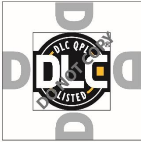
Figure 1: Clear Zone

No graphic element, including typed copy, tagline, rule, photo, or accompanying logo, should be positioned in this clear zone.