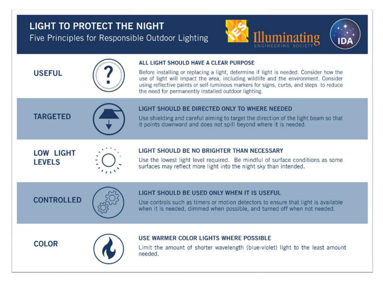
Figure 1: Five Principles for Responsible Outdoor Lighting