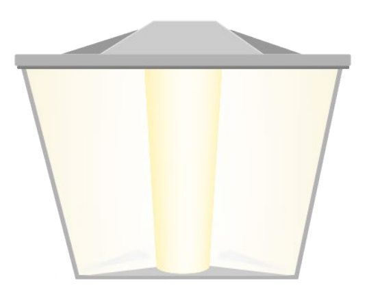
Figure 3: Isometric view of a troffer with a luminous basket and luminous panels on each side. The luminous shape would be represented by a rectangle or rectangle with luminous sides encompassing entire luminaire.