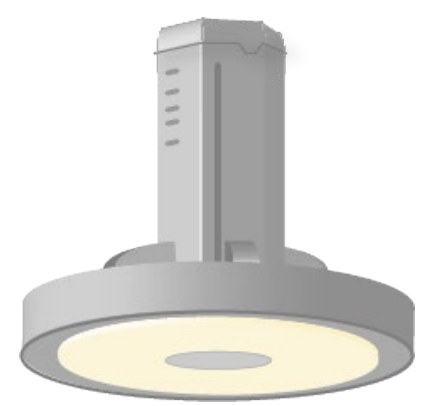
Figure 5: Isometric view of a high bay product with LEDs on the underside. The luminous shape would be represented by a 2D luminous circle, with length and width elements represented as negative values of the respective diameter (see LM-63 for details). If the luminous surfaces were on the sides as well, a vertical cylinder or rectangle with luminous sides would be used instead.

Figure 4: Isometric view of a linear ambient product with a luminous panel at the bottom. The luminous shape would be represented by a rectangle the size of the luminous panel only. If the sides were luminous, a rectangle with luminous sides would be used.