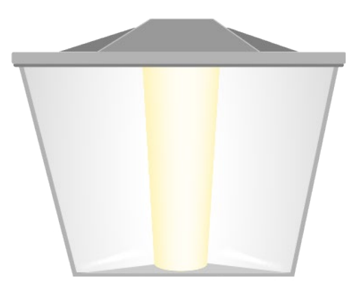
Figure 2: Isometric view of a troffer with luminous basket and non-luminous panels on each side. The luminous shape would have the width, length and height of the rectangle or rectangle with luminous sides encompassing entire luminaire.

For example, for a troffer with a luminous basket, the length, width and height of the entire luminaire must be represented as a rectangle with luminous sides or a rectangle, per Annex D in IES LM-63-02 (R2008). Figure 2 through Figure 5 show examples of luminous shapes for luminaires in each General Application.