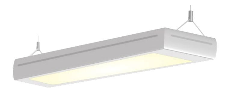
Figure 4: Isometric view of a linear ambient product with a luminous panel at the bottom. The luminous shape would be represented by a rectangle the size of the luminous panel only. If the sides were luminous, a rectangle with luminous sides would be used.