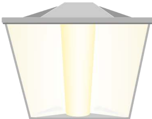
Figure 3: Isometric view of a troffer with a luminous basket and luminous panels on each side. The luminous shape would be represented by a rectangle or rectangle with luminous sides encompassing entire luminaire.