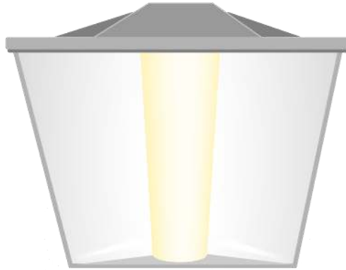
Figure 2: Isometric view of a troffer with luminous basket and non-luminous panels on each side. The luminous shape would have the width, length and height of the rectangle or rectangle with luminous sides encompassing entire luminaire.

For example, for a troffer with a luminous basket, the length, width and height of the entire luminaire must be represented as a rectangle with luminous sides or a rectangle, per Annex D in IES LM-63-02 (R2008). Figure 2 through Figure 5 show examples of luminous shapes for luminaires in each General Application.