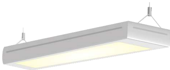
Figure 4: Isometric view of a linear ambient product with a luminous panel at the bottom. The luminous shape would be represented by a rectangle the size of the luminous panel only. If the sides were luminous, a rectangle with luminous sides would be used.