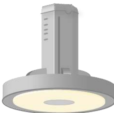
Figure 5: Isometric view of a high bay product with LEDs on the underside. The luminous shape would be represented by a 2D luminous circle, with length and width elements represented as negative values of the respective diameter (see LM-63 for details). If the luminous surfaces were on the sides as well, a vertical cylinder or rectangle with luminous sides would be used instead.