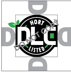
Figure 1: Clear Zone

No graphic element, including typed copy, tagline, rule, photo, or accompanying logo, should be positioned in this clear zone.