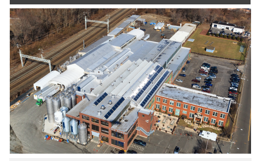
Two Roads Brewing Company located in Stratford, Connecticut modernized their lighting to capture energy savings and convenience.