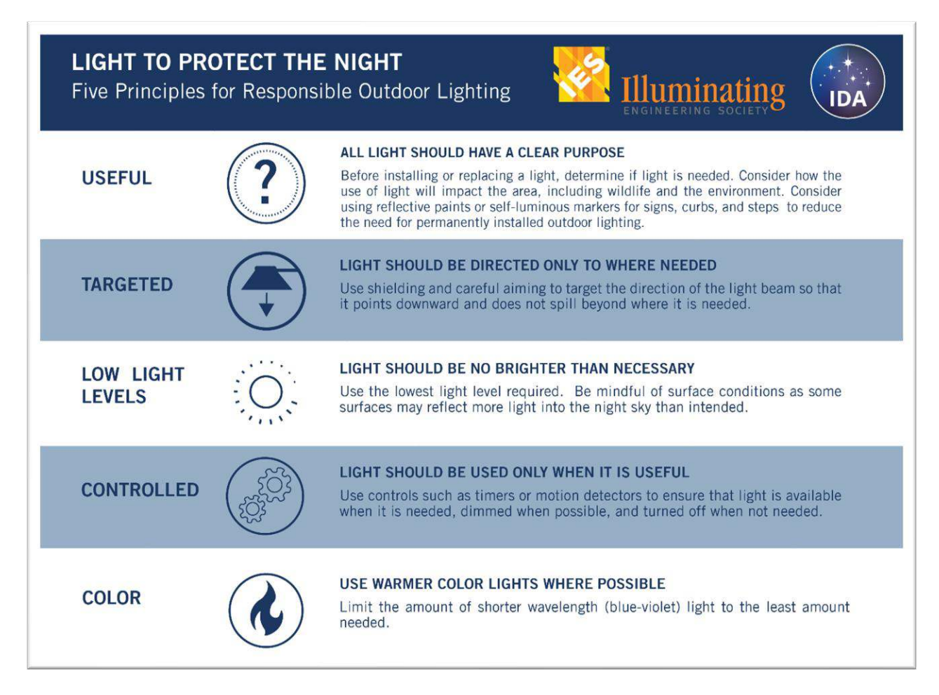
Figure 1: Five Principles for Responsible Outdoor Lighting