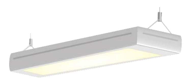
Figure 4: Isometric view of a linear ambient product with a luminous panel at the bottom. The luminous shape would be represented by a rectangle the size of the luminous panel only. If the sides were luminous, a rectangle with luminous sides would be used.

Figure 3: Isometric view of a troffer with a luminous basket and luminous panels on each side. The luminous shape would be represented by a rectangle or rectangle with luminous sides encompassing entire luminaire.