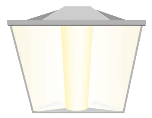
Figure 3: Isometric view of a troffer with a luminous basket and luminous panels on each side. The luminous shape would be represented by a rectangle or rectangle with luminous sides encompassing entire luminaire.