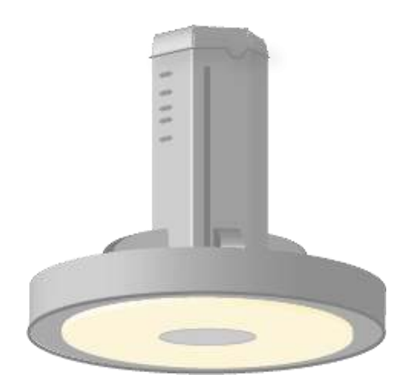
Figure 5: Isometric view of a high bay product with LEDs on the underside. The luminous shape would be represented by a 2D luminous circle, with length and width elements represented as negative values of the respective diameter (see LM-63 for details). If the luminous surfaces were on the sides as well, a vertical cylinder or rectangle with luminous sides would be used instead.

Figure 4: Isometric view of a linear ambient product with a luminous panel at the bottom. The luminous shape would be represented by a rectangle the size of the luminous panel only. If the sides were luminous, a rectangle with luminous sides would be used.